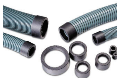
CTS-Endtülle CTS-end sleeve