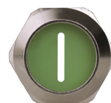
Flachkabeleinsätze flat cable inserts

Metall Kabelverschraubungen / metal cable glands