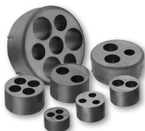
Mehrfachdichteinsatz (auf Anfrage) multiple seal insert (on request)